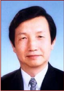
Mr. Ma Kai Chairman of National Development and Reform Commission

The Asia-Pacific Business Forum promotes the spontaneous exchange of views on trade and investment and a deliberation of current global and regional economic policy issues and their implications on the business sector. The National Development and Reform Commission of the People's Republic of China and the United Nations Economic and Social Commission for Asia and the Pacific invite you to be a part of this historic event and book your ticket to take advantage of this unique business development opportunity.